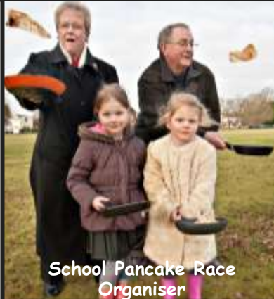
School Pancake Race Organiser