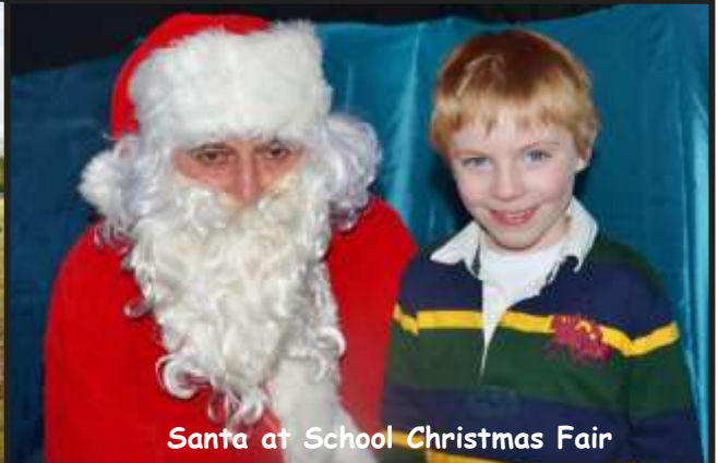
Santa at School Christmas Fair