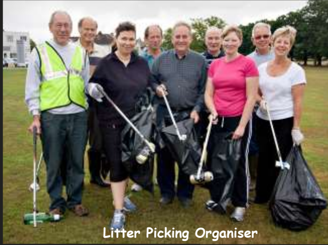
Litter Picking Organiser