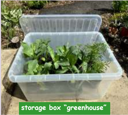
storage box "greenhouse"

Keep an eye on the new growth and flowering buds of your roses. If you notice that they are getting covered in greenfly you can spray with a mixture of water and a few drops of washing up liquid, rather than a chemical spray. It will control the greenfly until the ladybirds and blue tits arrive to help.