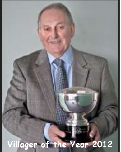
Villager of the Year 2012