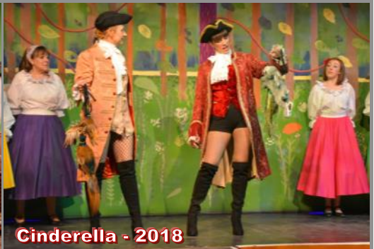
Cinderella - 2018