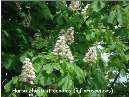
Horse chestnut candles (inflorescences).

Flowers, produced from mid April to mid May, have five fringed petals which are white with a blotch of red or yellow at the base. They are grouped in stiffly erect conical inflorescences often referred to as 'candles'. There was an old tradition of Chestnut Sunday when people had picnics under the blossom laden trees. This was revived by enthusiasts in 1977 to be held on the nearest Sunday to 11th May.