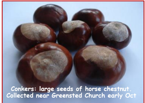
Conkers: large seeds of horse chestnut. Collected near Greensted Church early Oct

that no pieces remain on the string. If both conkers were new ones then the winner becomes a 'one-er'. If, for example, a two-er were to defeat a tenner it would become a twelver. Perhaps unsportingly, some conkers were hardened by baking in an oven or soaking in vinegar. According to Richard Mabey a World Conker Championship has been held since 1965 at the village of Ashton in Northamptonshire. The first record of the game of conkers was in 1848 but in earlier centuries children were playing 'conquerors' with hazel nuts and snail shells.