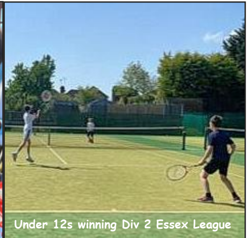
Under 12s winning Div 2 Essex League