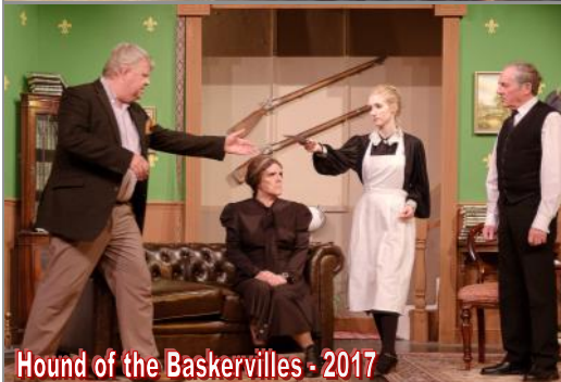
Hound of the Baskervilles - 2017