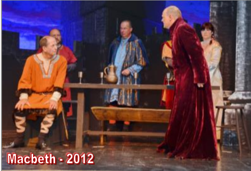
Macbeth - 2012