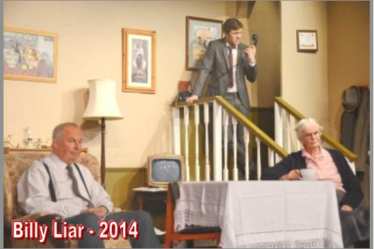
Billy Liar - 2014