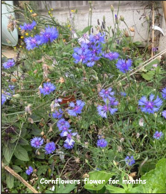
Cornflowers flower for months

Late September and October is the perfect time to sow seeds of hardy annuals which will over-winter and then grow away quickly in the Spring making bigger and earlier flowering plants. Just find the gaps in your borders, make shallow drills and sow the seeds about 5 to 7cm apart, cover with soil and water. Hardy annuals include poppies, cornflowers, nigella, larkspur, marigolds and ammi magus but NOT cosmos, nicotiana, or zinnias which are only half hardy and have to be sown in Spring.