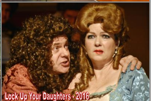
Lock Up Your Daughters - 2016