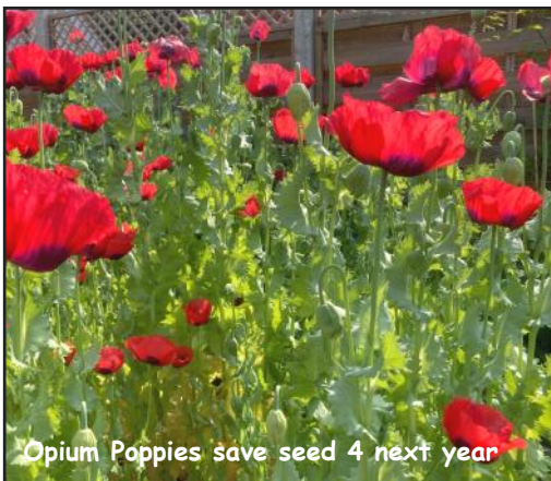
Opium Poppies save seed 4 next year

It is also the beginning of the bulb planting season so be sure to visit your nearest garden centre or nursery as soon as you can to get the best choice. If you can't plant them immediately, then keep them somewhere cool and dark meanwhile. Plant your daffodils, hyacinths, snowdrops and crocus as soon as you can. Tulips and alliums will wait a little longer. If you're pestered with squirrels digging up and eating your crocus and tulip bulbs then, apart from covering them with chicken wire to physically stop them, you should try to disguise the sites where you have buried them by covering them with fallen leaves and other debris.