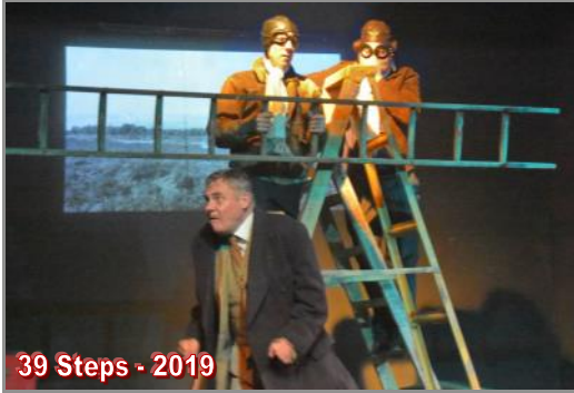
39 Steps - 2019