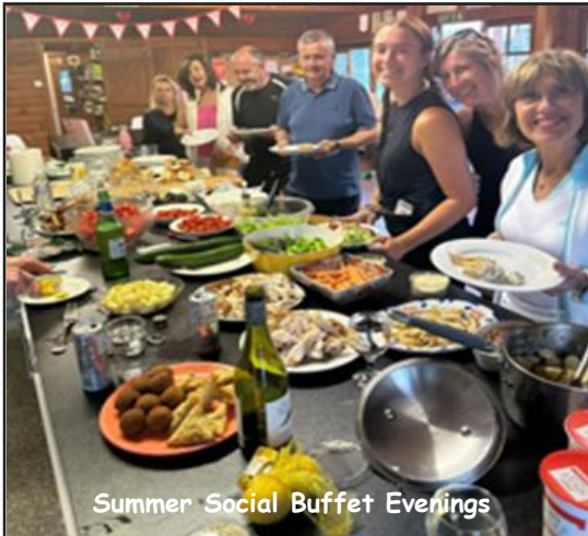
Summer Social Buffet Evenings

See our website https://linktr.ee/TheydonBoisLTC or contact the membership team if you would like to find out more. THEYDONTENNISMEMBERSHIP@GMAIL.COM