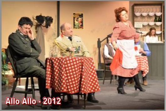
Allo Allo - 2012