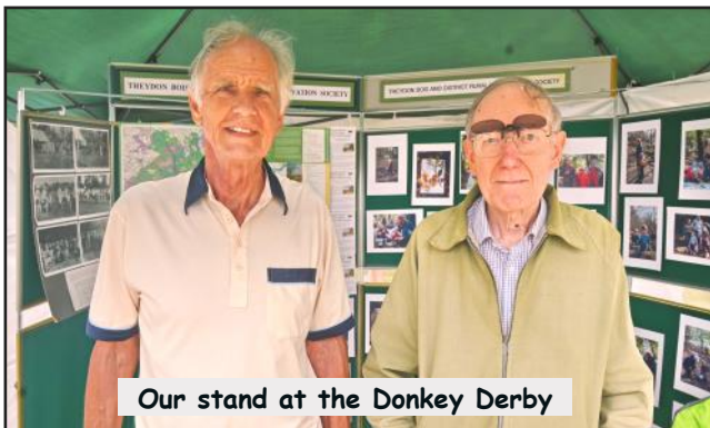
Our stand at the Donkey Derby