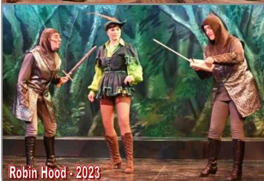
Robin Hood - 2023