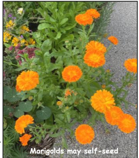
Marigolds may self-seed

If not all your tomatoes have ripened this summer, placing banana skins nearby will speed up the process as bananas produce ethylene, a hormone associated with the ripening of fruit. Once temperatures start to drop, you should harvest all your tomatoes and bring them inside. You can put the tomatoes in a drawer or a paper bag with a banana and it will help to speed up the ripening process. If you place bananas on the soil under the plant, then as they break down, amongst other things they provide potassium and calcium for the plants. Lack of calcium contributes to blossom rot, a common tomato problem.