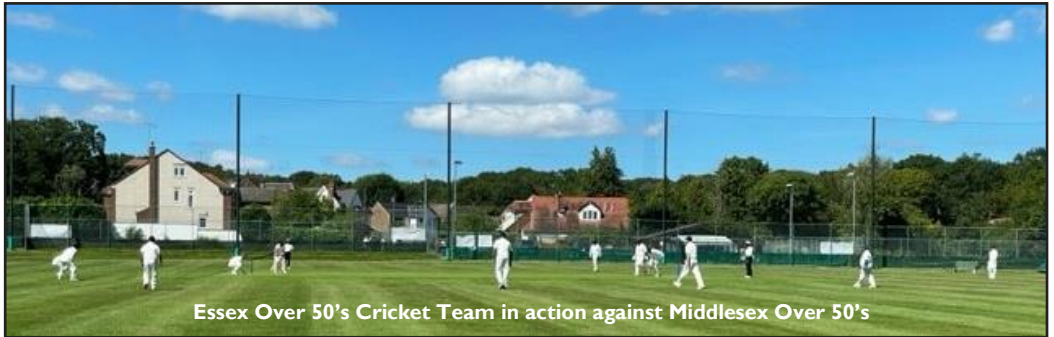
Essex Over 50's Cricket Team in action against Middlesex Over 50's

The Junior Section of the Club have also enjoyed another successful season. The U15 team won their league, while the U13's finished 3 rd and the U11's finished 2 nd in their respective leagues. The Club was also pleased to host the U15's West Essex vs South Essex match on the 1 st August.