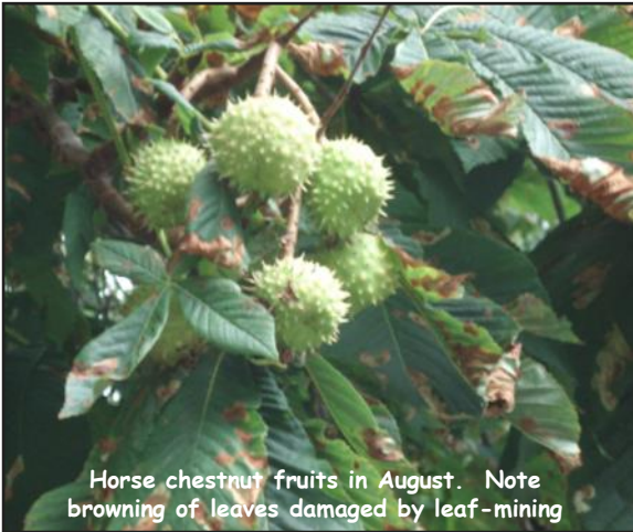
Horse chestnut fruits in August. Note browning of leaves damaged by leaf-mining

Conkers are mildly poisonous but there are no records of children suffering ill effects from nibbling the hard bitter flesh. Conkers contain soap-like chemicals called saponins which have sometimes been used in shampoos, In Victorian times there were recipes for making a 'flour' by grinding the conkers and leaching out the bitterness with hot water. More recently scientists have discovered that aesoin extracted from the seeds is an effective remedy for sprains and bruising.