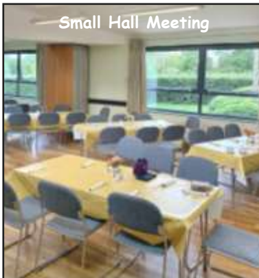
Small Hall Meeting