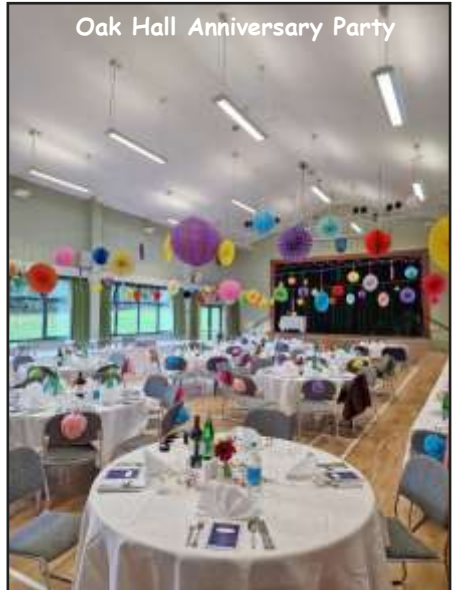
Oak Hall Anniversary Party