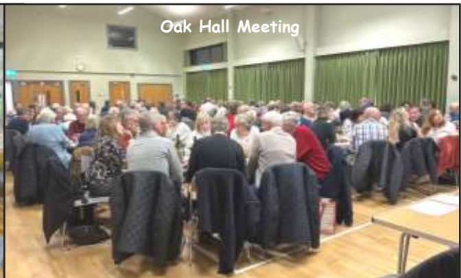
Oak Hall Meeting